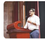
विषय विशेषज्ञों द्वारा मार्गदर्शन