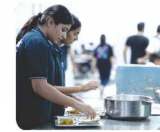
गुणवत्तापूर्ण पौष्टिक भोजन