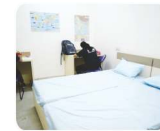
सेपरेट हॉस्टल (Boys / Girls)