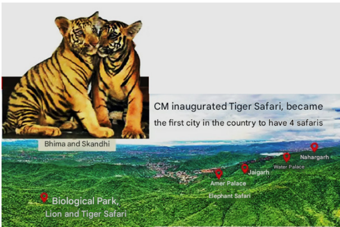
CM inaugurated Tiger Safari, became the first city in the country to have 4 safaris