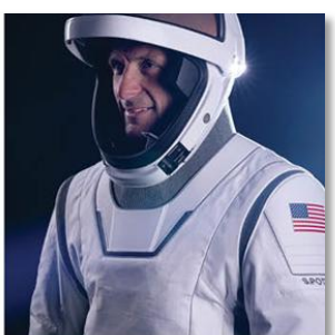
किड पोटेट पायलट