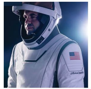
जेरेड आइसेकमैन मिशन कमांडर